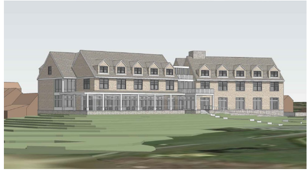
Proposed New Residence Hall